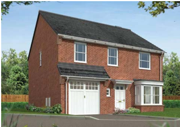
Example House Types